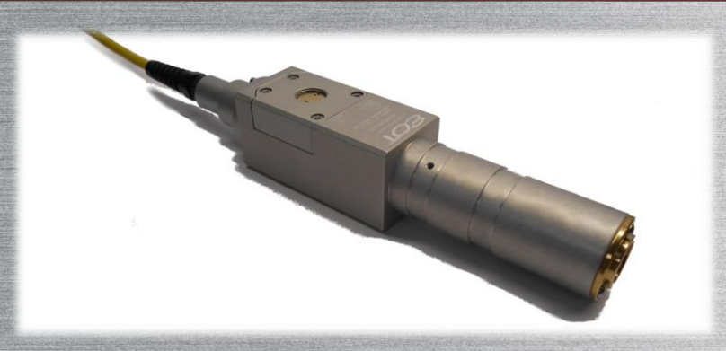
FIBER LASER ISOLATORS