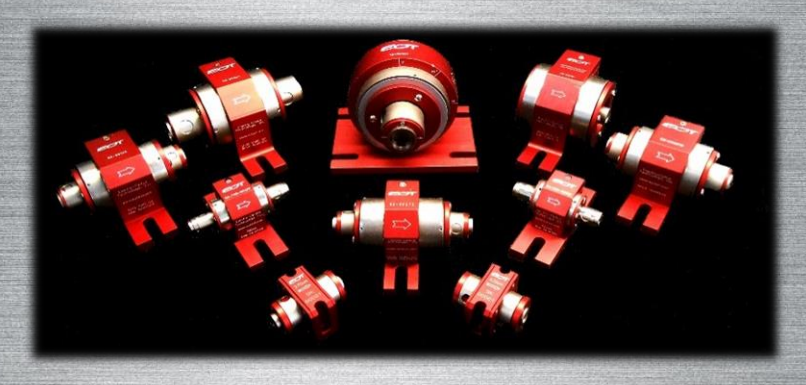
FREE SPACE OPTICAL ISOLATORS